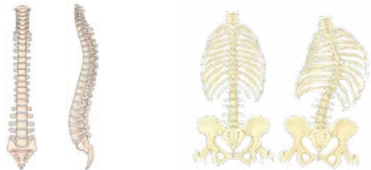
Normal spine viewed from the front (left) and side (right)

The scoliotic spine is rotated or twisted to form a multi-dimensional curve. Spinal curvature from scoliosis may occur on the right or left side of the spine, or on both sides in different sections. Both the mid (thoracic) and lower (lumbar) spine may be affected by scoliosis.