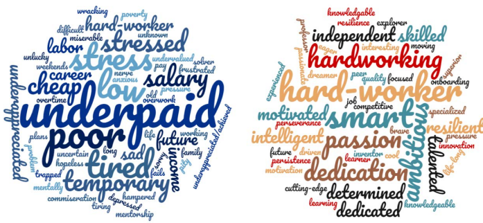
Figure 2. Submissions grouped by negative (left) or positive (right) connotations. Neutral words were not included.