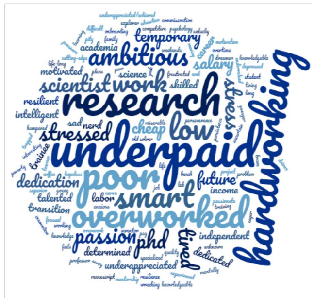
Figure 1. Summary of responses. Word clouds show the variety of responses with text size in proportion to their frequency.

In July 2019, the BCH postdoc association (PDA) Public Affairs committee was interested to know what it is like to be a postdoc? We asked the Boston Children's research community to define how they perceived postdocs with only three words. 76 people, the majority of which were postdocs (85%), answered our survey. We combined their answers to generate word clouds ( Figure 1 ).