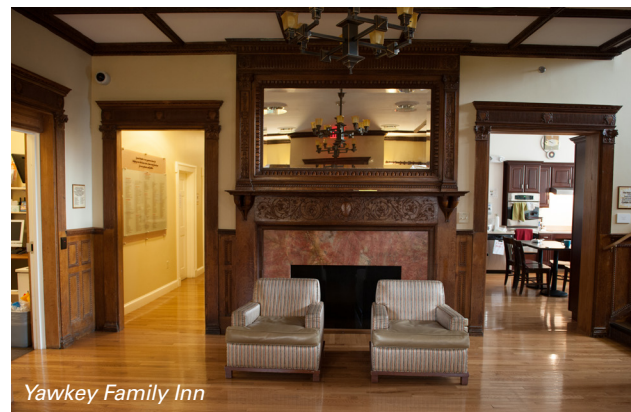
Yawkey Family Inn